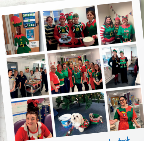
Thank you to everyone who took part in the National Elf Service and helped to raise £2,800.