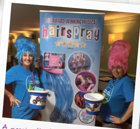
A massive thank you to the Grand Opera House York for their continued support and for raising £12,000 to date from after-show bucket collections.