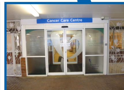
Cancer Care Centre