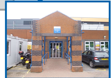
Neurosciences & Sleep Services