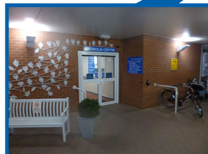
The Magnolia Centre