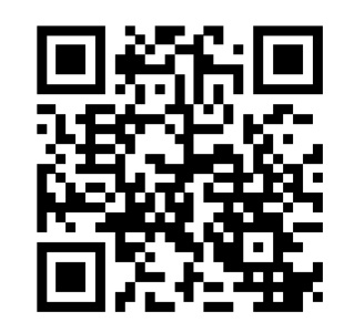
Scan me to view this leaflet online

© 2023 York and Scarborough Teaching Hospitals NHS Foundation Trust. All Rights reserved.