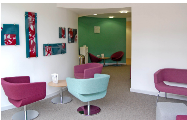
The waiting area in the Bereavement Suite, a Kings Fund project and a winner of the Best Interior Design Award at the Building Better Healthcare Awards 2011

Artwork and carefully designed spaces create a calming atmosphere, decrease anxiety and contribute to the healing process. Involvement in the arts is an important part of health and well being 1 . Research has shown that the use of the arts in hospitals can reduce stress and depression, increase staff morale, decrease a patient's length of stay and even contribute to the reduction of the use of some medications 2 .