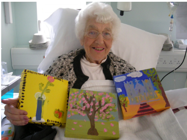
A renal patient with paintings she worked on while on dialysis

A variety of techniques and materials are used by the artists and patients such as mosaic, pen and ink, wire sculpture, animation, collage and painting. Many of the finished pieces of work are displayed around the hospital.