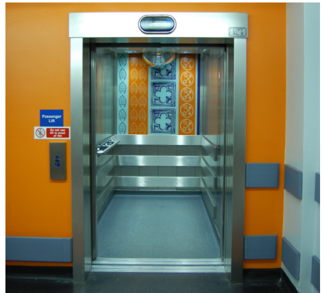
Glass art work by Dan Savage in the new patient lifts

The design and refurbishment of spaces is the important task of many departments in the hospital, including the capital planning team, facilities, estates, purchasing and infection prevention, as well as the staff and users. The arts are an important part of the projects contributing art work, new design ideas and colour schemes.