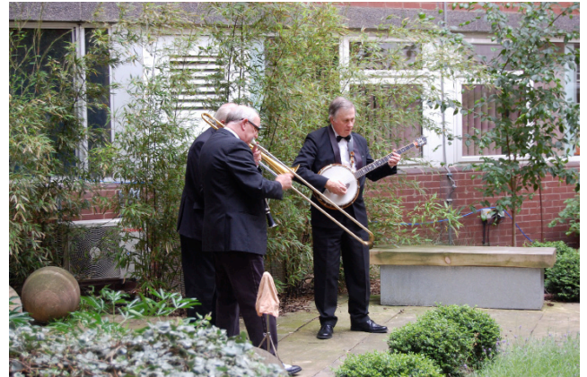
The jazz band, 'Bejazzled' playing in the Nightingale Courtyard

At least once a week we welcome musicians into the hospital to play live music in the public areas (such as the coffee shop) as well as performing for the patients and staff on the wards.